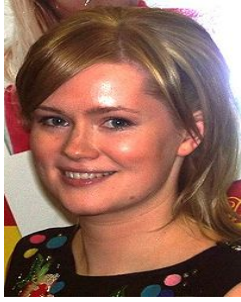
Cecelia Ahern, 31, the author, wrote lots of other story books - P.S. I

Love You; Love, Rosie; If You Could See Me Now; There's No Place Like Here; and The Gift. The daughter of Ireland's former prime minister. She lives in Dublin, UK.